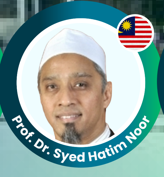
Plenary 5 Universiti Sultan Zainal Abidin, Malaysia