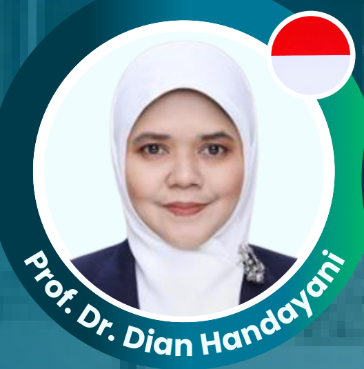
Plenary 2 University of Brawijaya, Indonesia