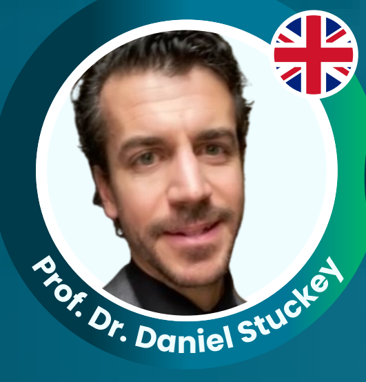
Keynote Address University College London, UK

Theme: "Cardio-Cerebrovascular Health & Metabolism: From Bench to Bedside"