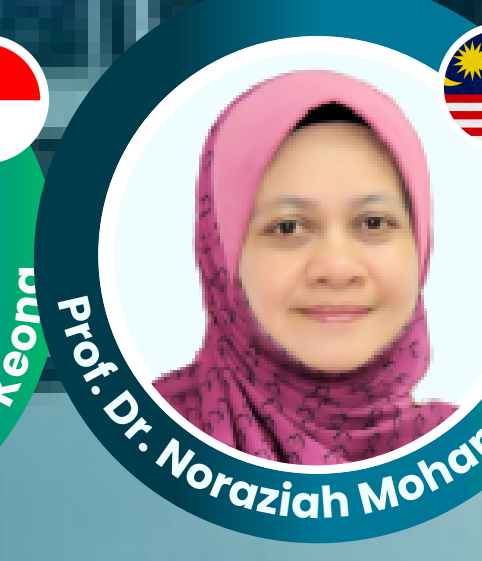
Plenary 4 Universiti Kebangsaan Malaysia, Malaysia