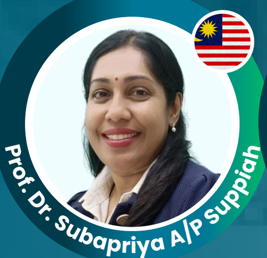
Plenary 1 Universiti Putra Malaysia, Malaysia